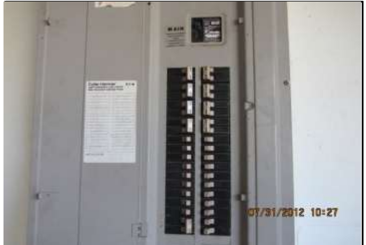
Main Breaker Panel 200 Amp Service