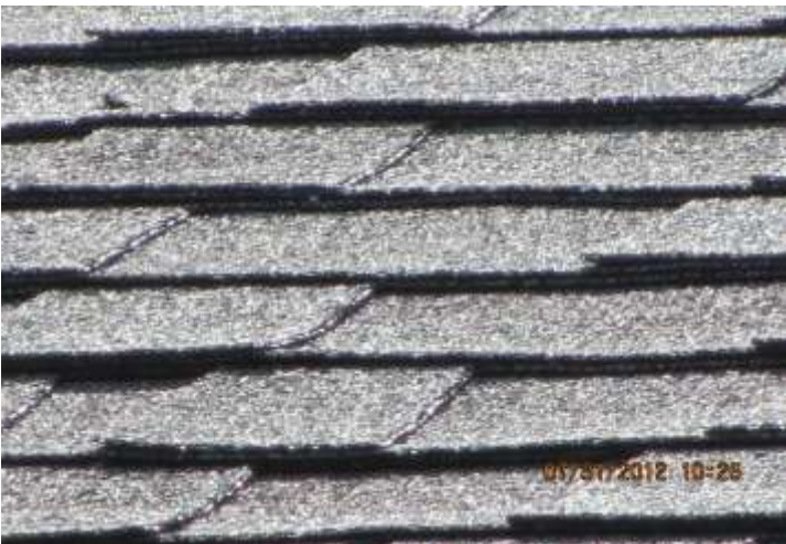
Asphalt-Fiberglass Shingles No Curling or Other Noticable Deterioration