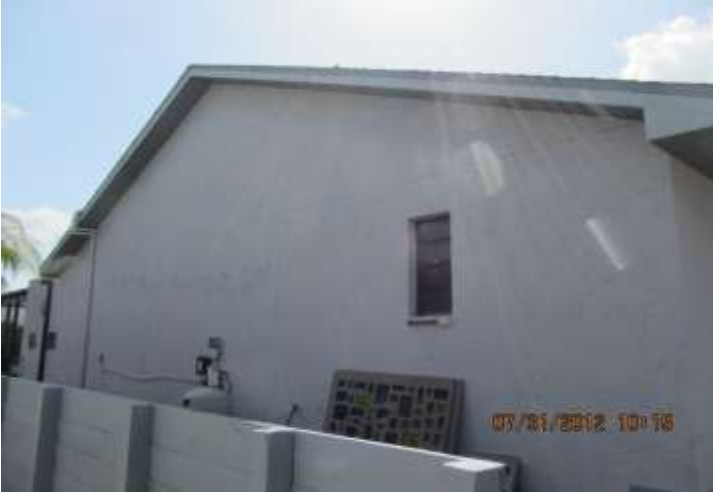
Left Elevation Gable Roof Geometry