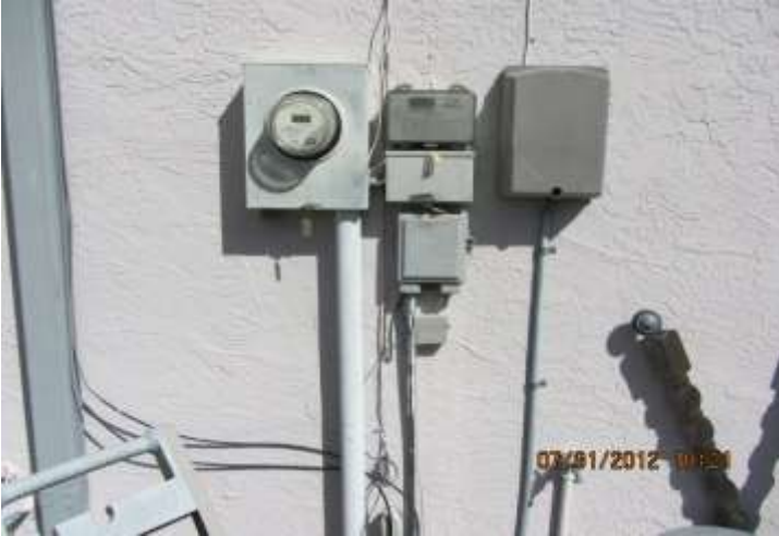
Electric Supply Electric Meter