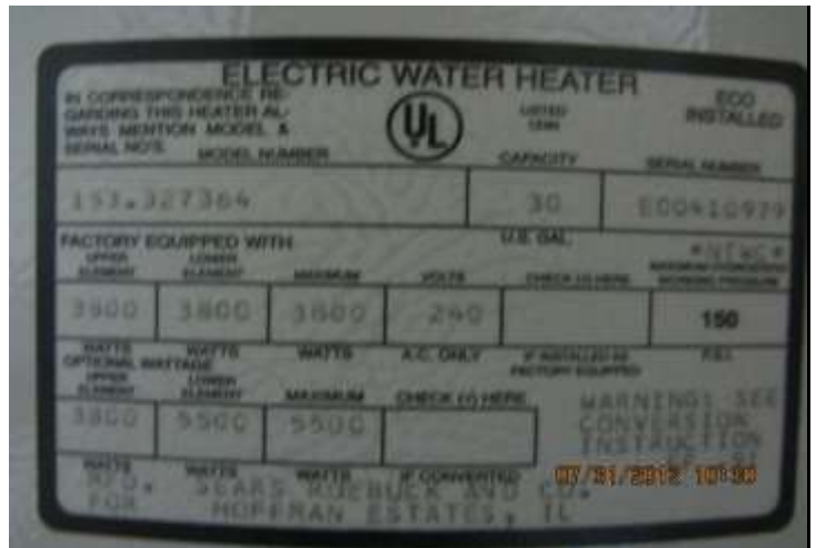
Kenmore Water Heater Manufacturer's Tag