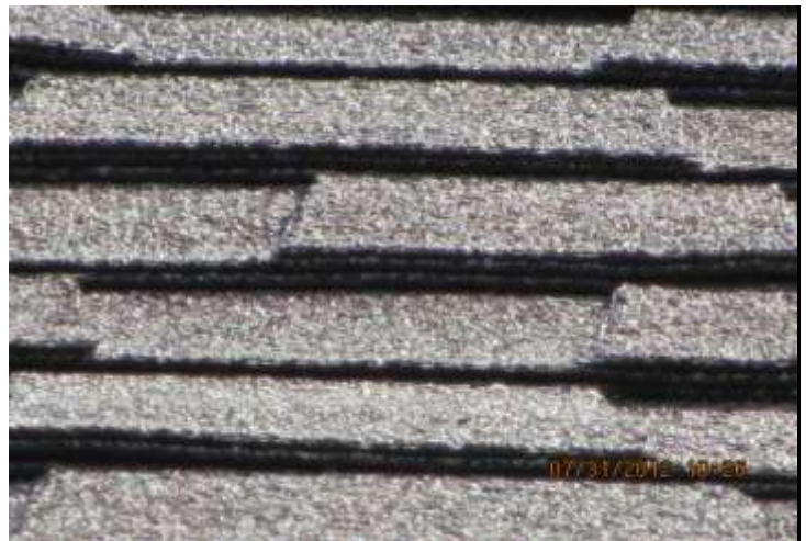
Asphalt-Fiberglass Shingles No Noticable Loss of Granules