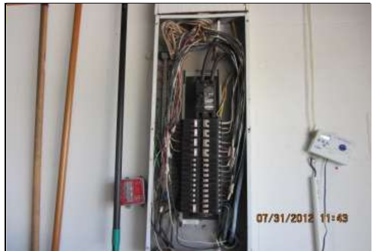
Main Breaker Panel Dead Panel Removed