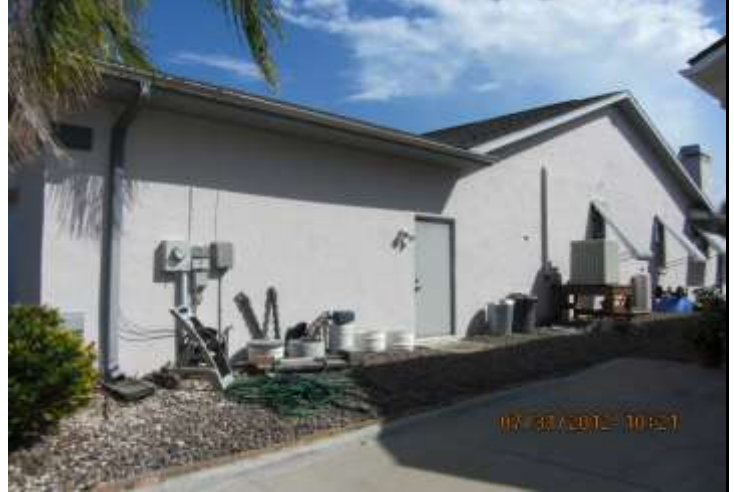
Right Elevation Gable Roof Geometry