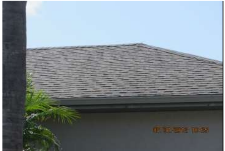
Asphalt-Fiberglass Shingles No Sagging