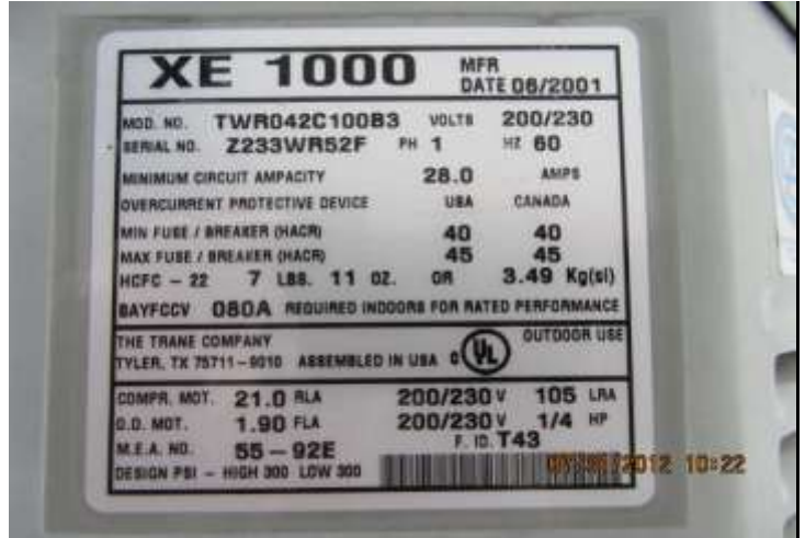
A/C Condensor Unit - Manufacturer's Tag Trane XE 1000