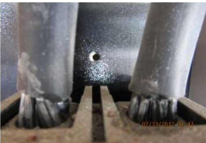
Main Breaker Panel Aluminum Stranded Main Service