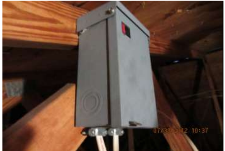
A/C Evaporator - Heater Shut-Off Breaker Box