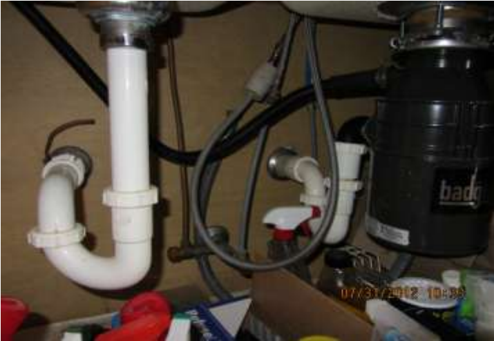
Kitchen Sink Plumbing PVC Drain Lines & CPVC Supply Lines