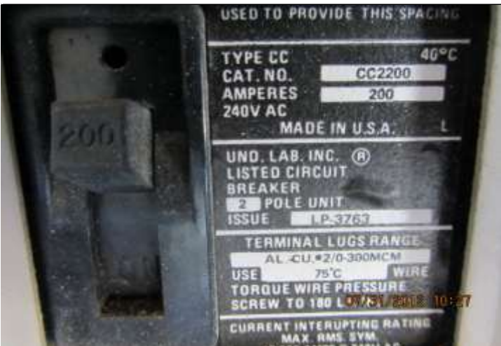
Main Breaker Panel 200 Amp Main Breaker