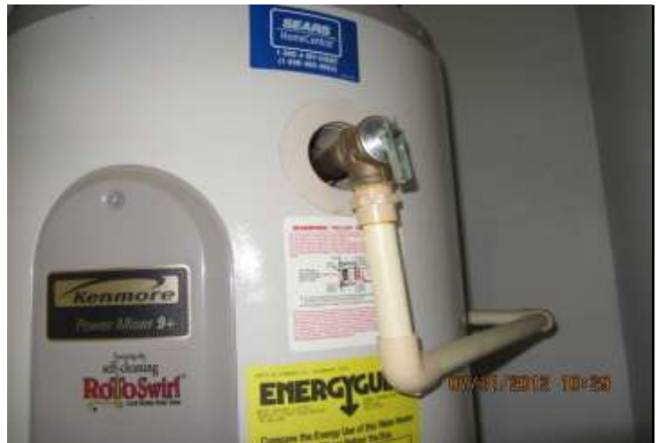
Kenmore Water Heater Pop-Off Valve