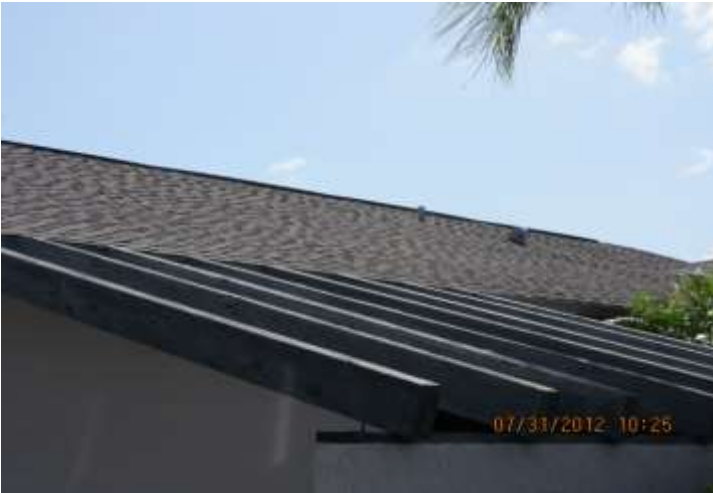
Asphalt-Fiberglass Shingles No Sagging