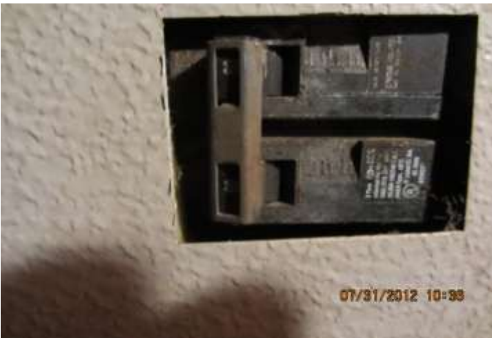
A/C Evaporator - Heater Unit Shut-Off Breaker