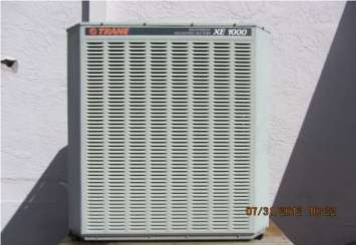
A/C Condensor Unit Trane XE 1000