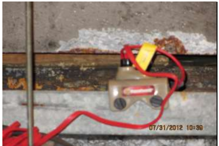
A/C Evaporator - Heater Float Switch Shut-Off