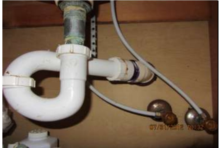
Bathroom Plumbing PVC Drain Lines & CPVC Supply Lines