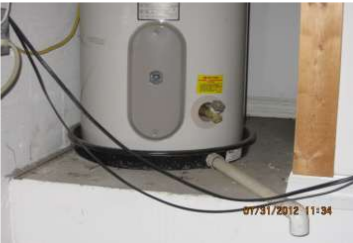
Kenmore Water Heater Bottom Pan & Drain