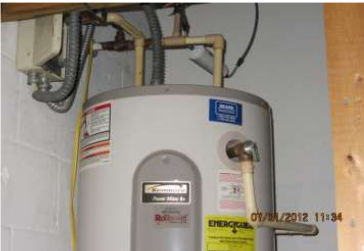
Kenmore Water Heater CPVC Piping