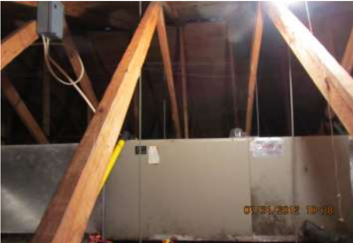
A/C Evaporator - Heater Located in Attic - No ID Tag